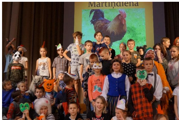
October harvest celebration