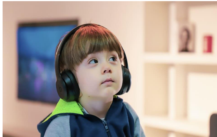
Audio video relaxation