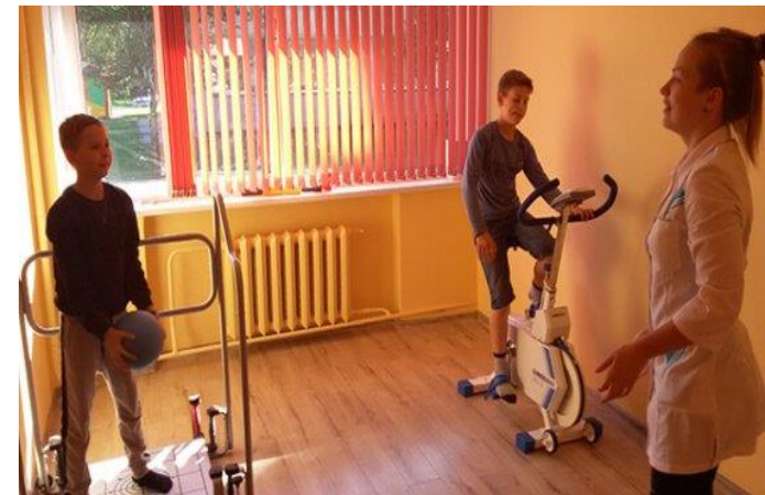
Balance and coordination exercises